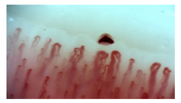
Early Scleroderma Pattern