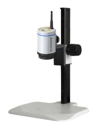
V2, 2018 www.inspect-is.com