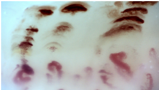
Active Scleroderma Pattern