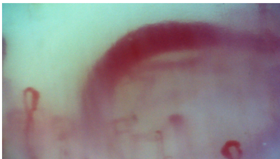
Late Scleroderma Pattern